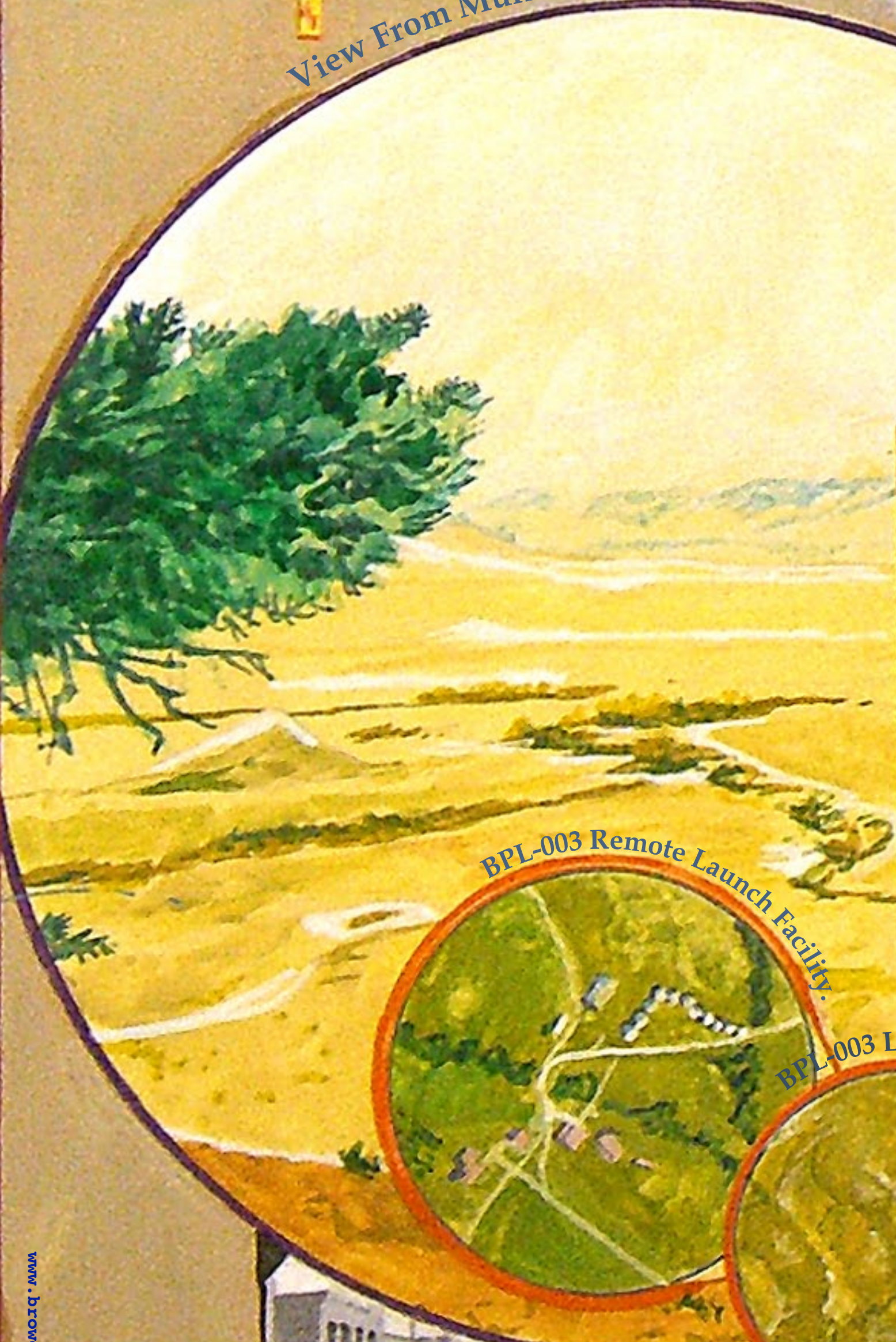
View From Munin Landing Site.

At any rate, BPL is soliciting funds for the project. Our Sincere Unselfish Creative Kind Erudite Reliable Supporter (SUCKERS) program was designed for just this purpose. Since BPL-002 was such an overwhelming and surprising success (we raised dozens of dollars for our Outsourcing Mission To China), we thought another scam might work. As our supply of tourist-style paintings made in China with American Outsourced Labor is all but exhausted, we thought we'd offer a similar incentive for this event. Genuine tourist-style paintings executed by a scout sent to the Yellowstone region will be available in our inimitable fake-genuine vernacular, inspired by 19th century impulses, if not skills. We will be happy to offer these paintings to the aerospace community, or any other taker, with the understanding that proceeds will be applied to advancing the goals of BPL-003. As always the paintings come with overdetermined packaging, needlessly complex certification, collectible cryptic statements, and entreaties for escalated donation. The price of these unique but compact handcrafted renderings is set at USD $150.00. As a