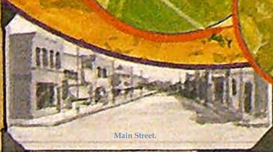
Livingston, MT Attractions.