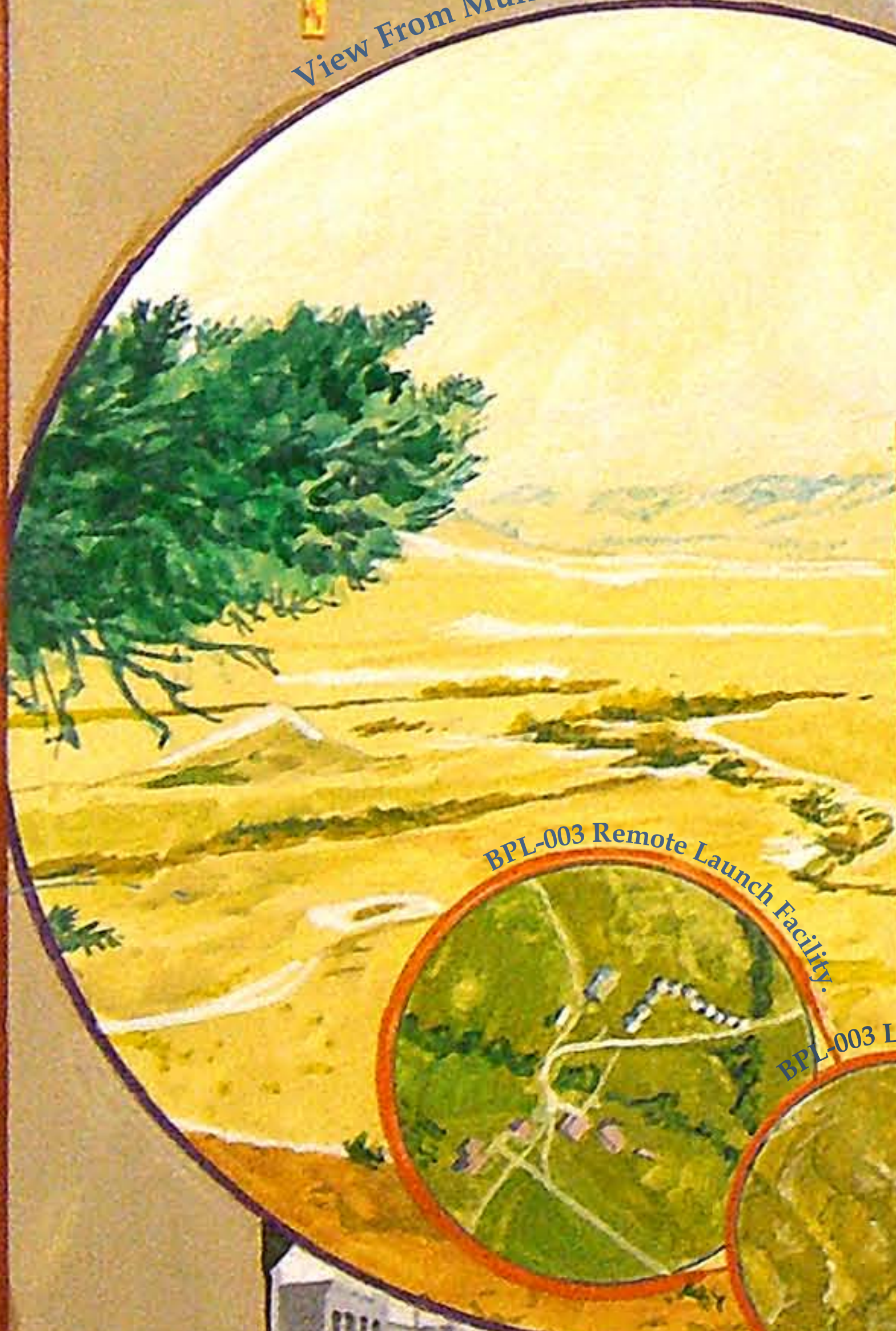
BPL-003 Remote Launch Facility.