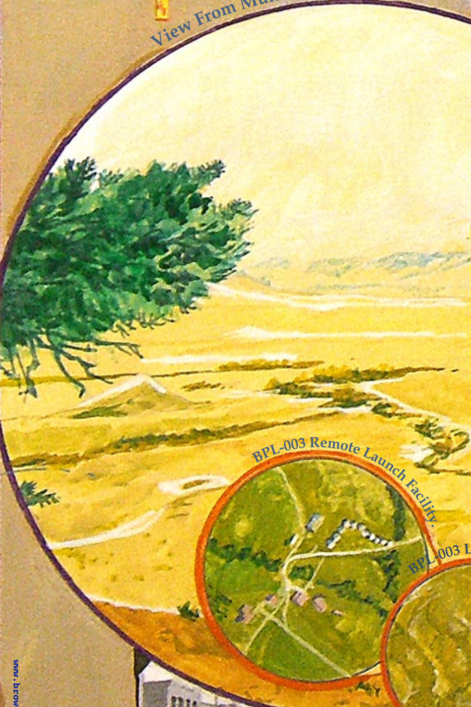
BPL-003 Remote Launch Facility.