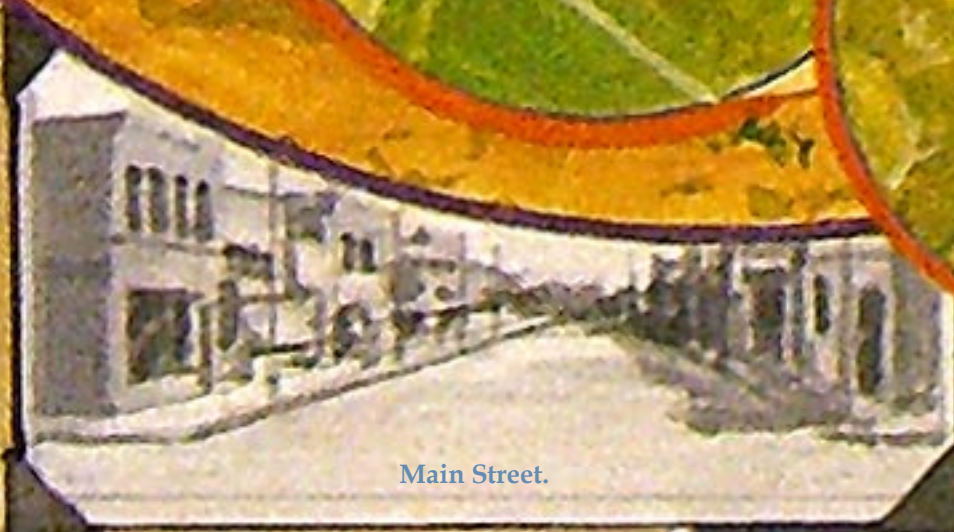
Livingston, MT Attractions.